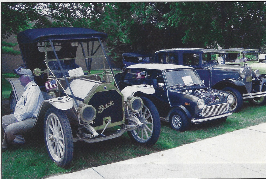
At the 2002 Sloan Summer Auto Fair you could find a wide variety of cars displayed in one area. Shown here is a 1911 Buick and a BMW Mini.