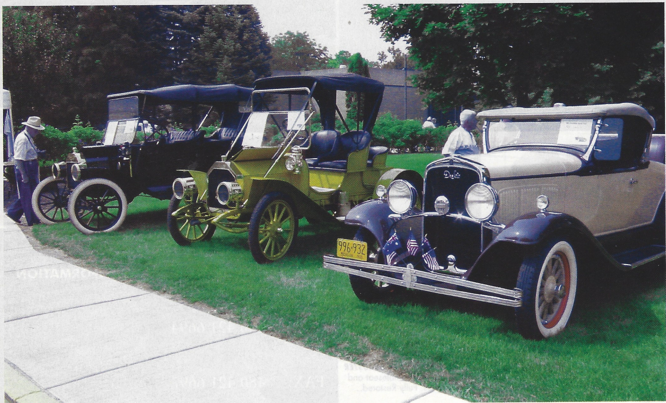
Vintage cars, such as these three gems, could be found throughout the grounds.

and largely due to its lovely, tree-shaded location and its wonderfully eclectic mix of vehicles. Open to any vehicle, with no classes or age restrictions, it typically offers the fairly new next to the very old, the fairly common with the very rare, and a few fascinating things you may have never seen before. There are also