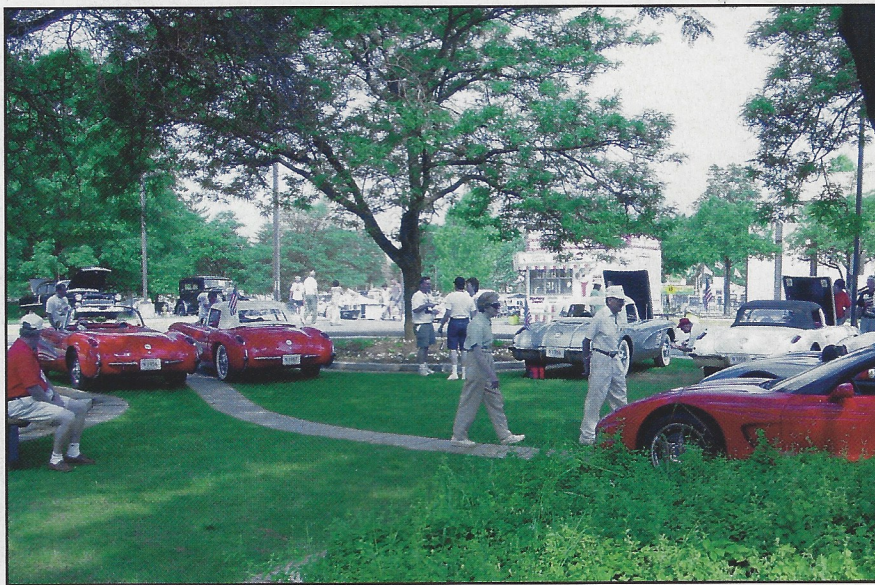
One of the featured attractions at this year's show was the 50th Anniversary Corvette Historic Motorama. The display includes one privately-owned Corvette from each production year (1953-2002), plus a 50th Anniversary 2003 model.

The Sloan show has prospered for 30 years partly because of the hard work and hospitality of its organizers