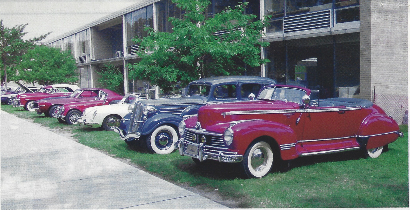
Part of the event's charm is its eclectic mix of cars.